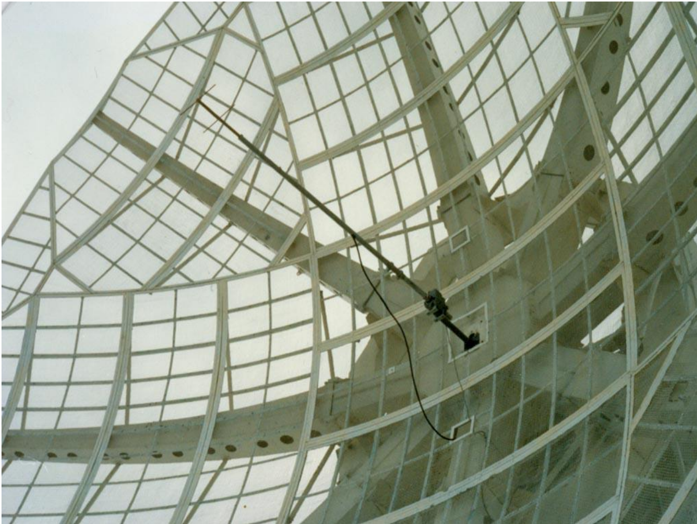
The dish 10m, f/D 0,26, mesh 10x10mm with feed dipole&reflector – rotary polarization